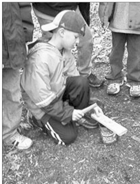
A Cecil County fourth grader performs a soil compaction test in the woods to see if the soil there is better for flood control than that in an open area.