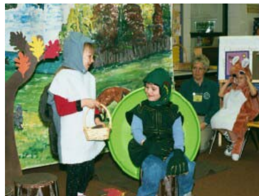
Children enjoy "becoming" the animals while learning from "Mother Nature" at a recent Kindergarten Outreach Program at Calvert Elementary given by the staff from the Nature Center.

(Look for Camp flyer insert at end of newsletter)